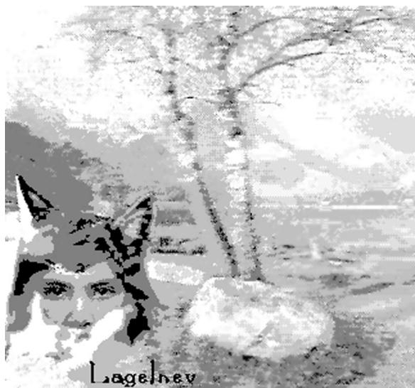
Lagelnev, a spirit of nature Picture received summer of 1996 via computer, Lux-