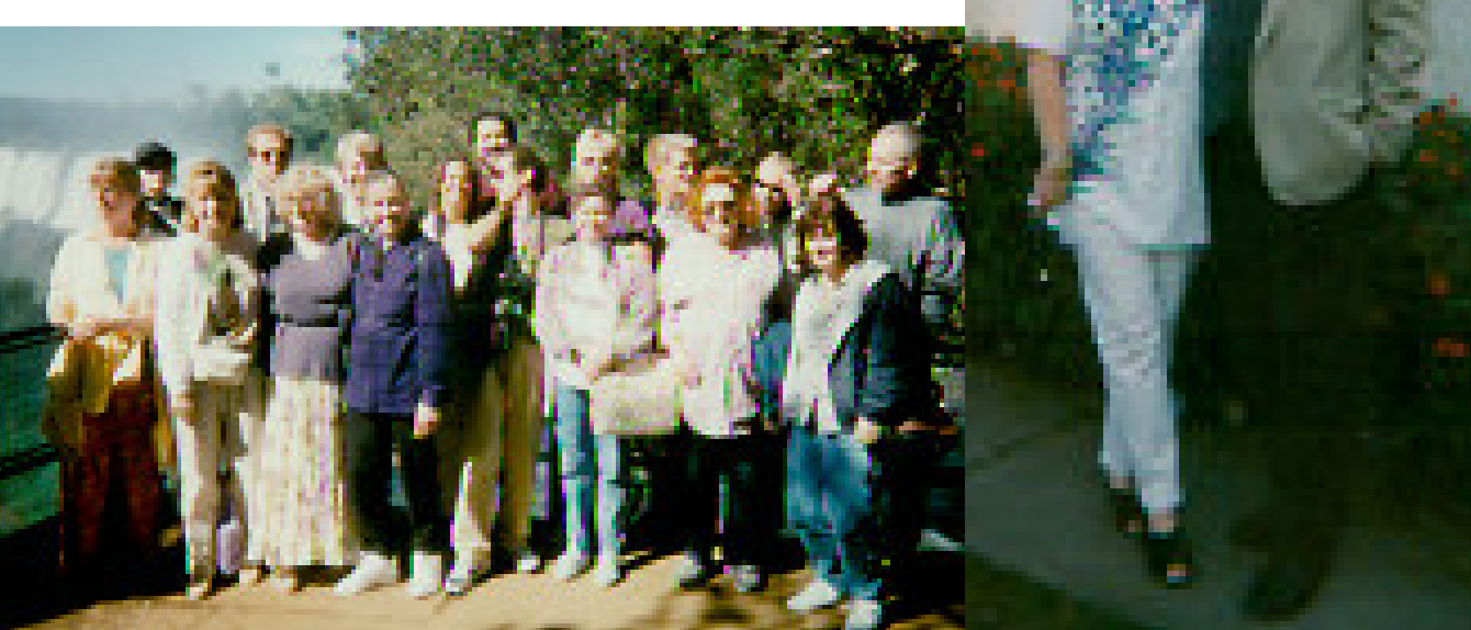
All contacts are copyright protected by the individuals who received them; further, Contact! provides blanket copyright protection for all published contacts.