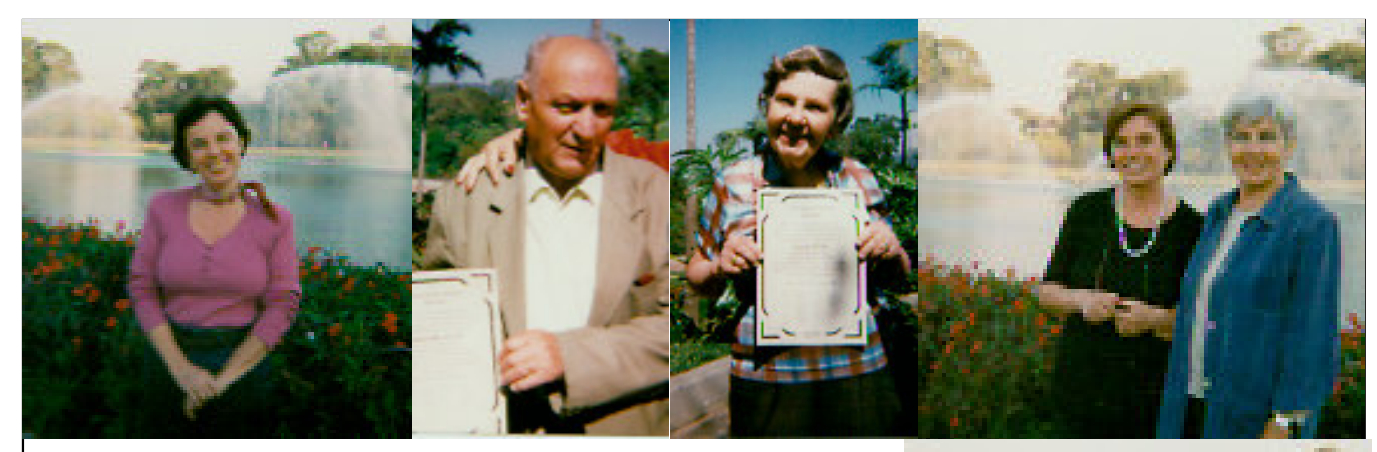
The Third Annual INIT Meeting, August 1997